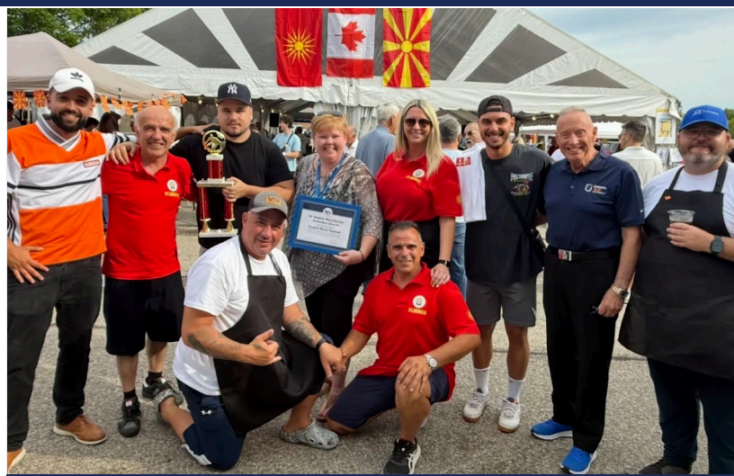
St. Nedela Festival - Macedonian Orthodox Church