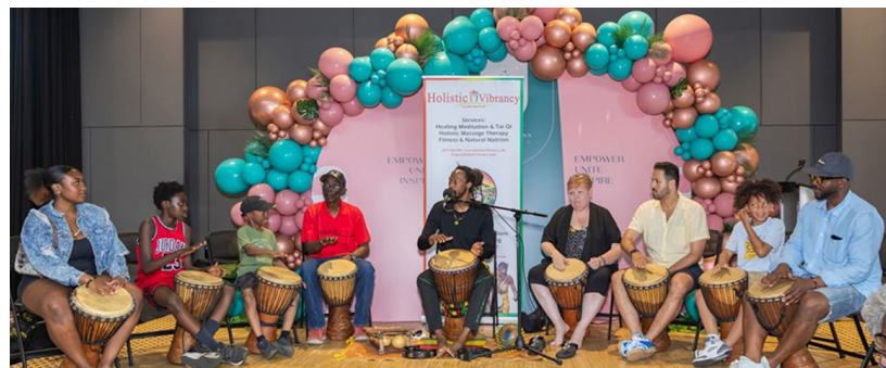
Black Queens of Durham 2025