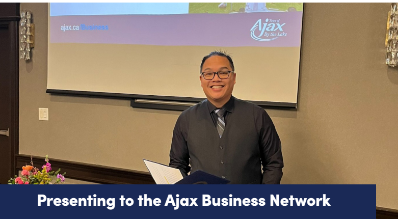
Presenting to the Ajax Business Network