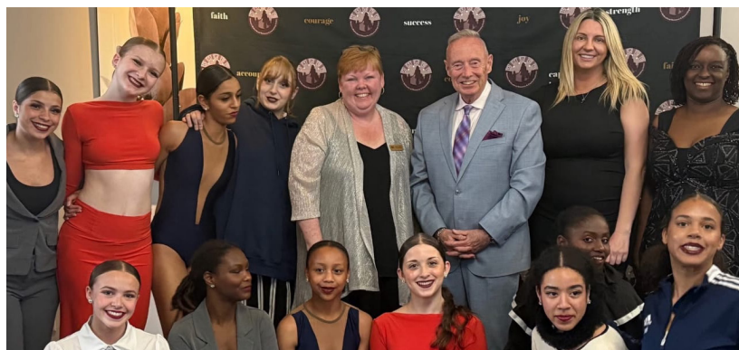
Women's Multicultural Resource and Counselling Centre of Durham 32nd Gala of Hope