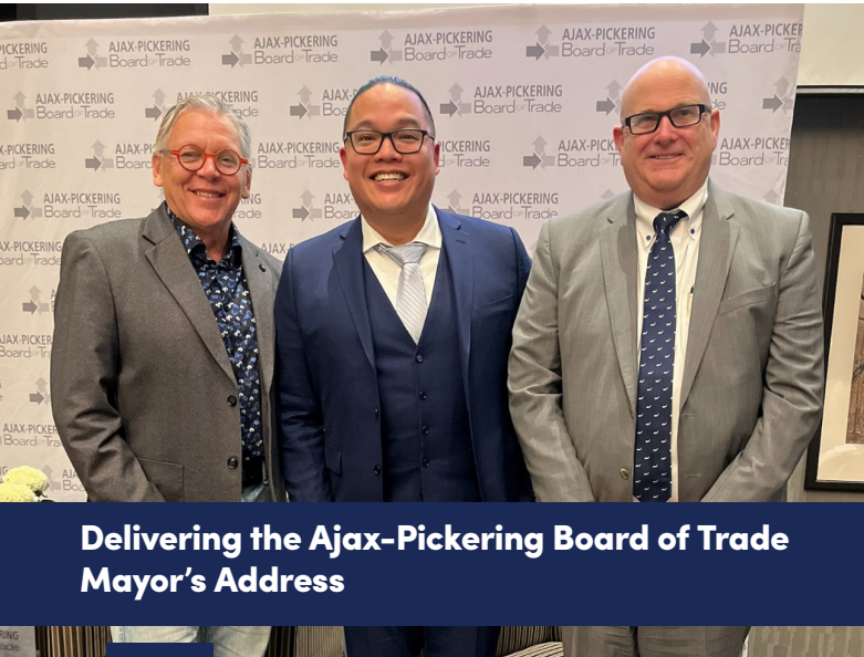
Delivering the Ajax-Pickering Board of Trade Mayor's Address