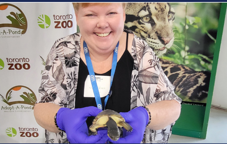
Toronto Zoo 12th annual release of juvenile Blanding's Turtles