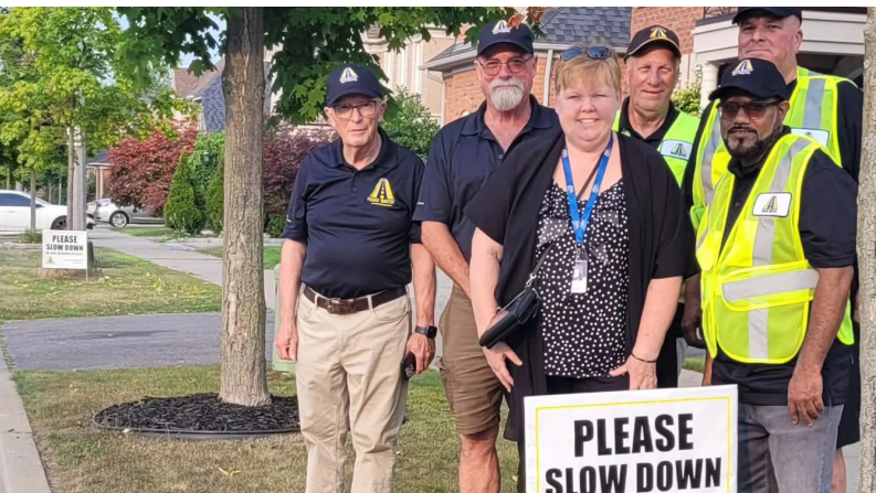
Ajax Pickering Road Watch