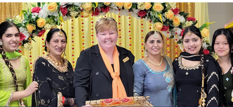
Punjabi Teeyan-Teej festival of rainy season hosted by Durham Punjabi Cultural and Diverse Minds Collective